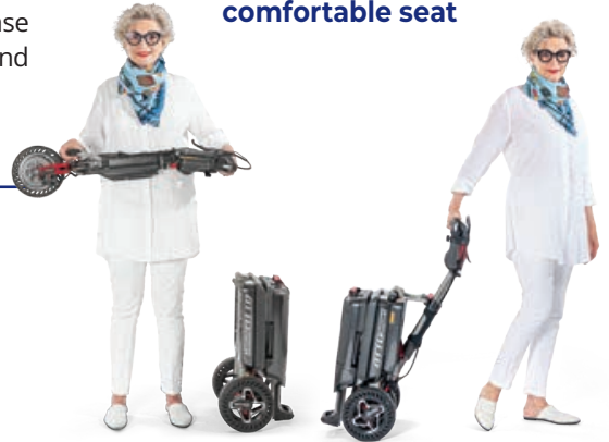
Splits into 2 lightweight parts for easy lifting