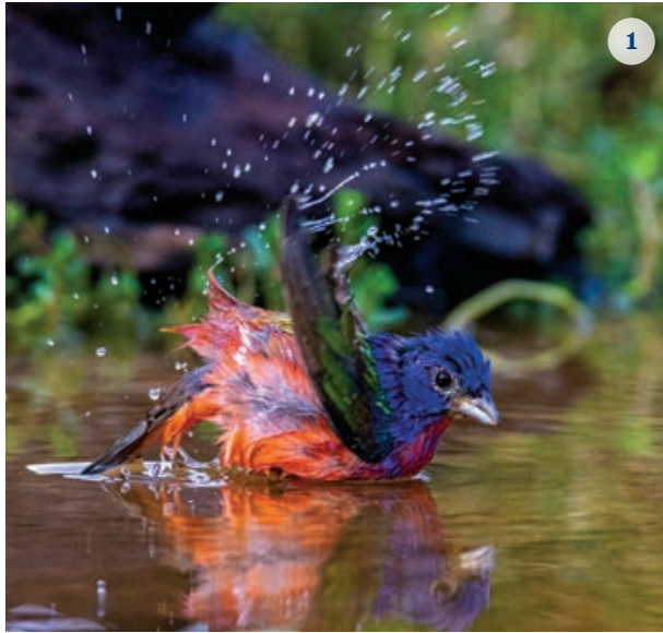
1 RAY BEDNAR BLUEBONNET EC A painted bunting bathing.