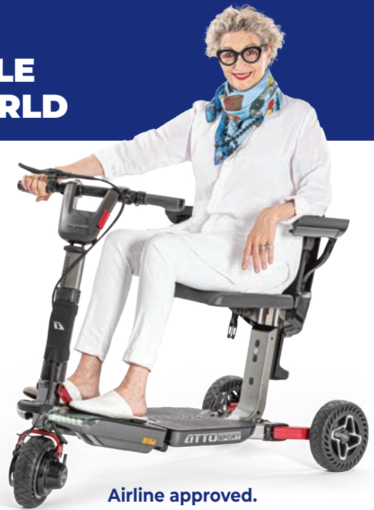
Airline approved. Spacious legroom, comfortable seat