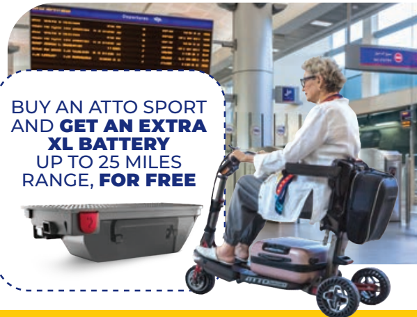
Folds in 3 seconds, rolls like a trolley suitcase

BUY AN ATTO SPORT AND GET AN EXTRA XL BATTERY UP TO 25 MILES RANGE, FOR FREE