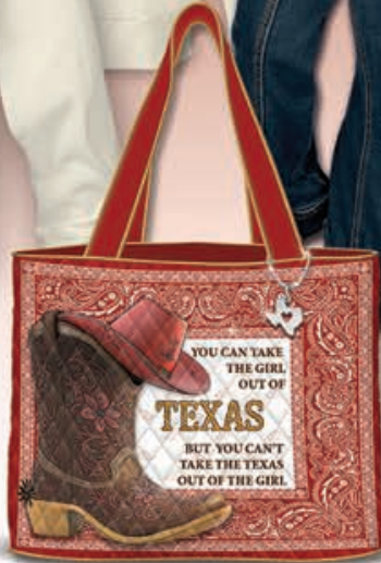
2. Heart of Texas Quilted Tote

Hoodie and tote feature a silver-tone Texas charm