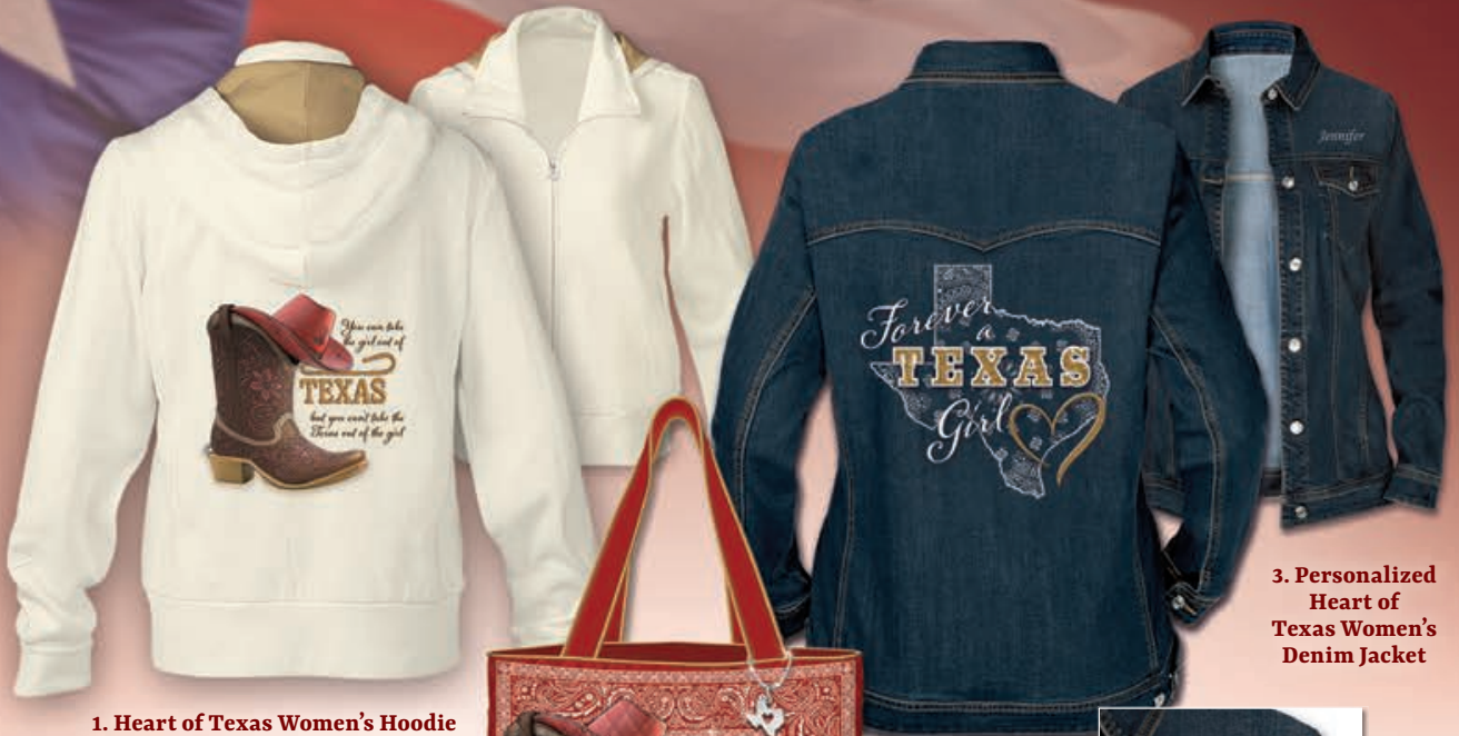
1. Heart of Texas Women's Hoodie