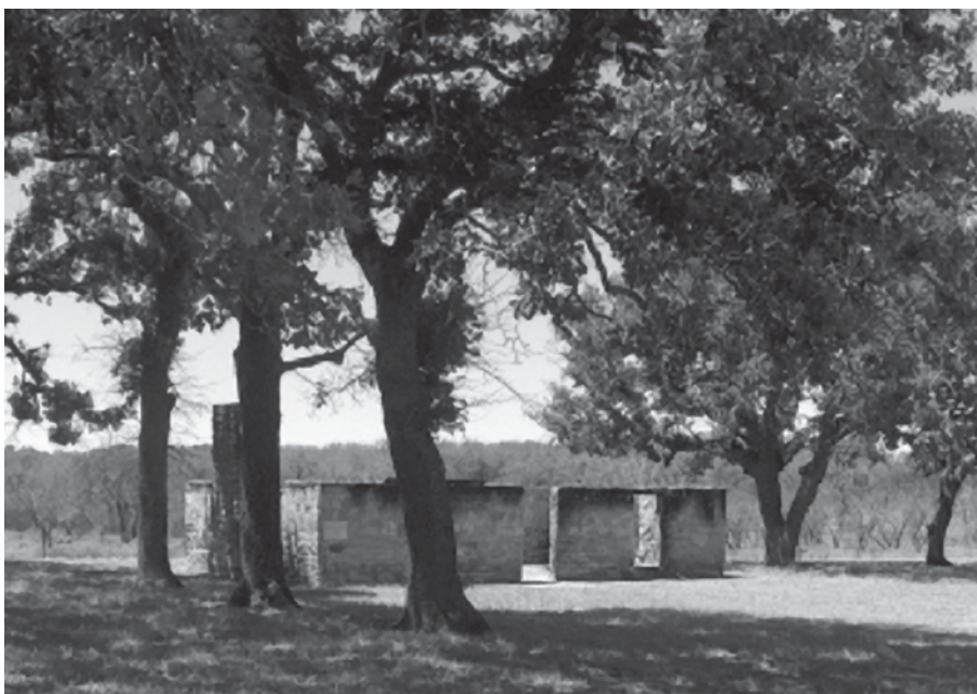
The old Kokomo 4-H Club building, ravaged by tornadoes and fire, still stands nestled within a grove of oak trees.

boasted a cotton gin, a photo gallery and a barber shop, as well as three doctors. It had its own consolidated school district from the 1880s to 1942. The 4-H clubhouse, which still stands but has been ravaged by storms and fires, was the first of its kind in the United States. Pictures of it appeared in newspapers in the Eastern states. All the original 18 boys who helped to found the club participated in World War II. Two