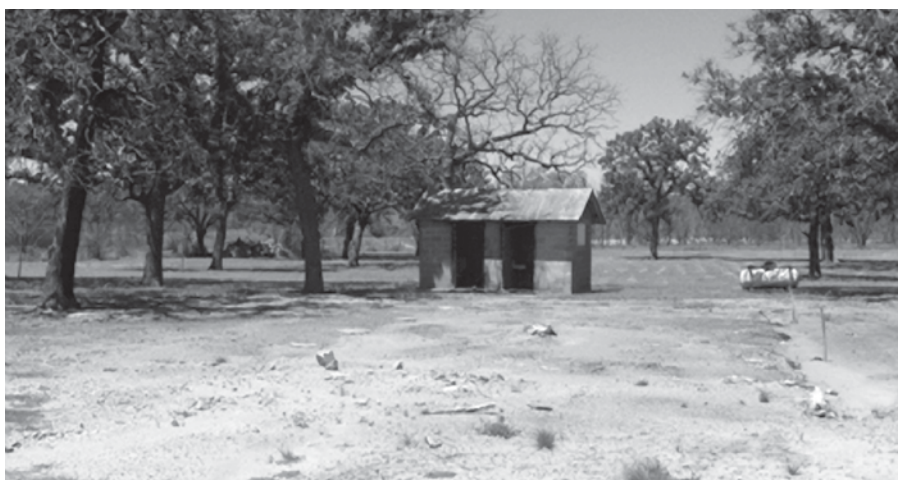
The site of the old schoolhouse/community building after the fire. All that remains is a shell of the old bathrooms that stood behind the building.