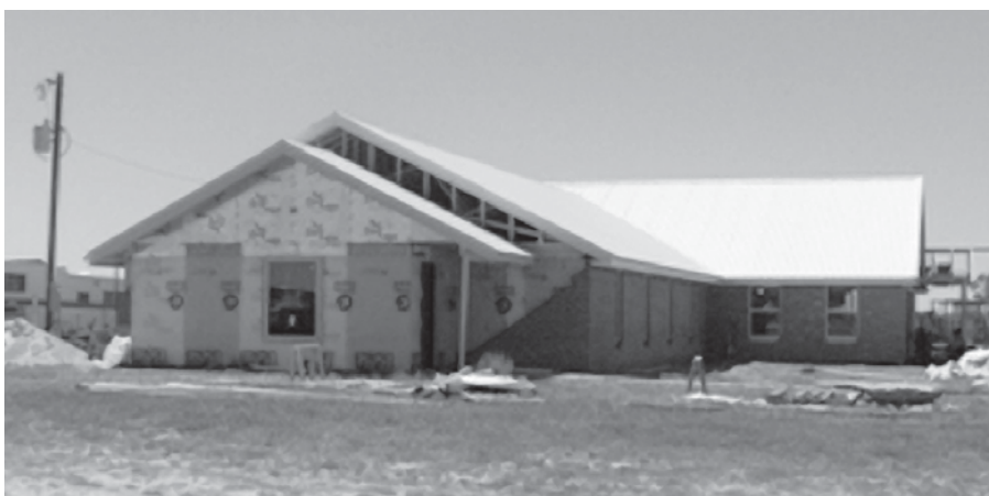
Construction of the new Kokomo Baptist Church is well underway.

to Eastland County as well as our big state of Texas. Like many small communities, it stands for fortitude, loyalty, dedication and honest, hard-working labor. Just like Comanche