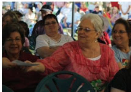
Members receive gifts donated by vendors and cooperative supporters.