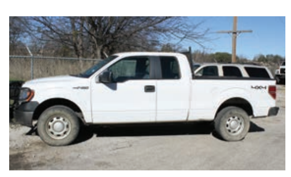
Truck #599—2011 Ford F-150; extended cab; 5.0-liter engine; 6-speed automatic transmission; mileage: 157,700 miles*; minimum bid: $5,000

CECA reserves the right to reject any or all bids at the discretion of the board.