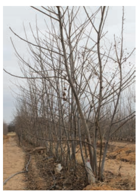
Womack Nursery sells up to 20,000 pecan trees per year. These 8-foot trees are the average size sold. Once they grow past the 8-foot stage, they become harder to transplant.

Larry Don says 50 percent of his promotion is word of mouth, the success of which is mostly due to the nursery's reputation for longevity, coupled with experience. (Between Larry Jim and Larry Don, the two have an accu-