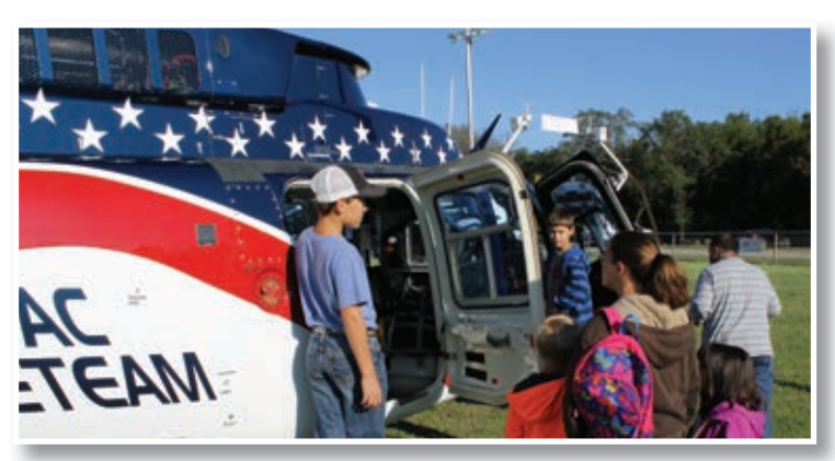
The Air Evac Lifeteam crew allows CECA members and guests to tour the air ambulance.