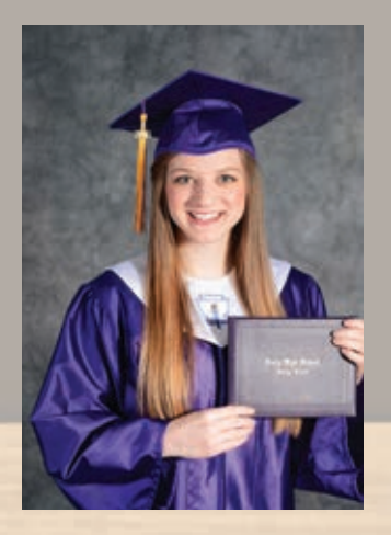
Holli Hullum Early ISD