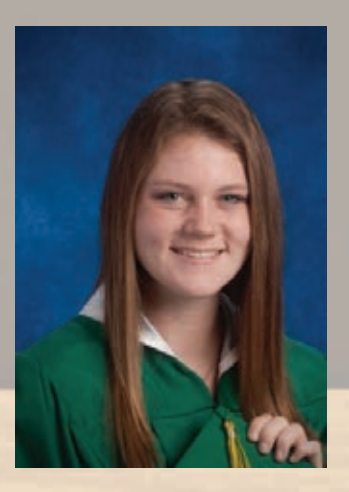
London Jones Dublin ISD