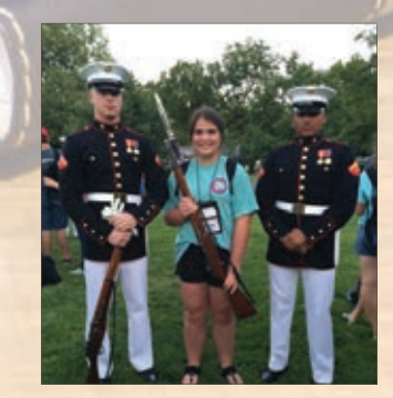
Iwo Jima Parade