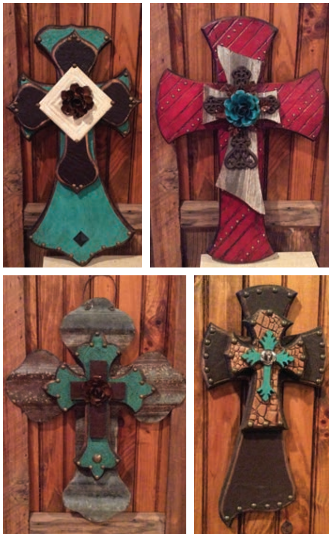
Bar T creates many beautiful crosses.

As far as wood types, there is no shortage of choices in the Bar T stock supply. What they prefer to work with is cedar, as it is easy to work with, dries more quickly and does not bow and warp as badly as other woods. The color of cedar wood is always consistent, allowing them the freedom to build pieces out of multiple trees and have them match.