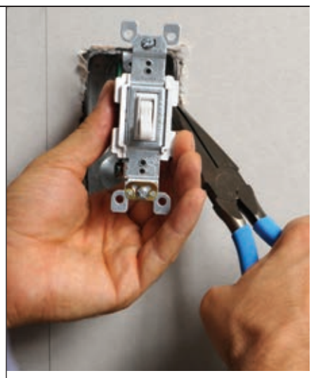
Have switches inspected by a professional as soon as you notice a problem.

Please help us keep our linemen-and our community-safe. Remove any unauthorized items attached to utility poles. Fixtures not belonging to the cooperative or another utility will be removed by CECA line personnel; the co-op is not responsible for any losses if an item is damaged or destroyed during removal.