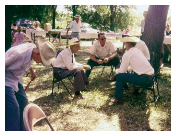
A group of men visits at a Cunningham reunion in the 1960s.

for the newly formed Republic of Texas. They settled first in Titus County then moved on to Bastrop, Travis and Williamson counties before they found home in what was at that time an unnamed portion of the Upper Leon River country—now Comanche, Texas.