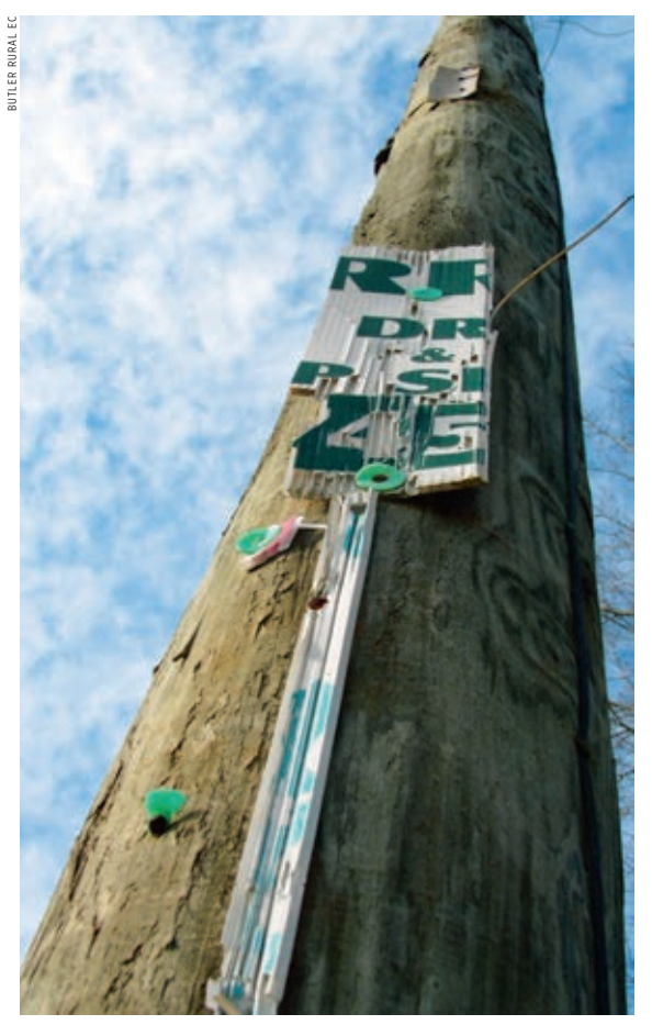
Signs and objects illegally attached to utility poles can be a safety hazard for line crews that climb these poles.

WHAT DO YARD SALE SIGNS, basketball hoops, deer stands, satellite dishes and birdhouses have in common? They're often found illegally attached to utility poles. But this isn't only a crime of inconvenience. Safety issues caused by unapproved pole attachments place the lives of CECA lineworkers and the public in peril.