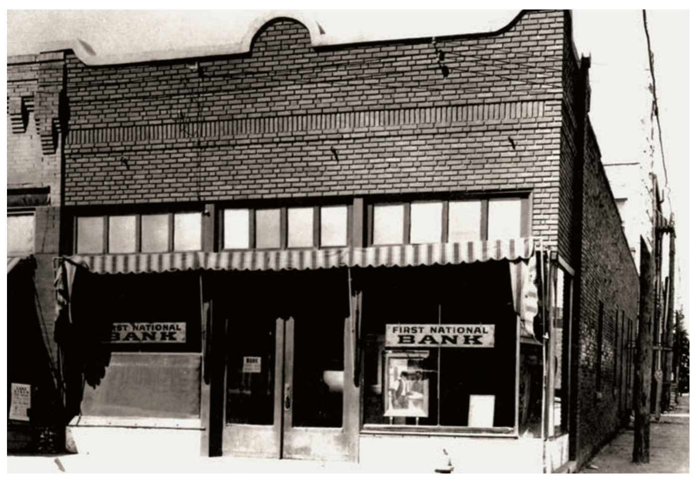
The First National Bank of Cisco as it looked in 1927

and pushed them toward the alley door at gunpoint.