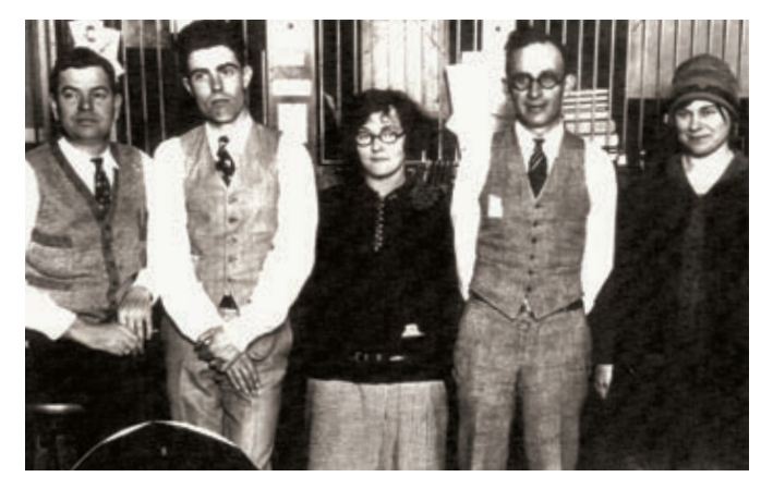
When the robbery and manhunt became headline news, the bank tellers who had been on duty during the robbery posed together at the scene of the crime.