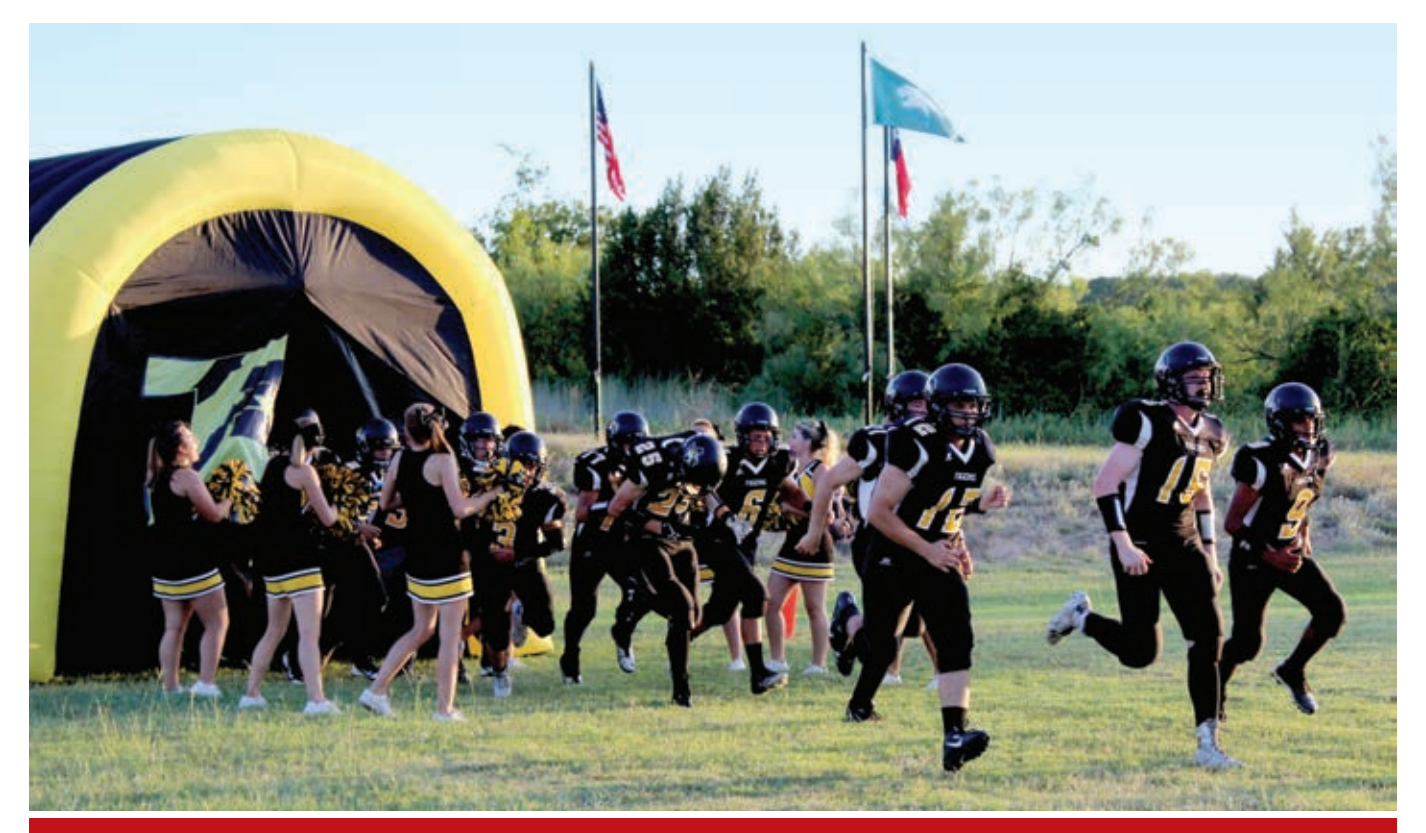
TOP: A Blanket Tiger watches a game from the sidelines after sustaining an injury during practice, his teammates and the action reflected in his sunglasses. ABOVE: The Blanket Tigers break through their tunnel as they take the field for their game against Bluffdale.