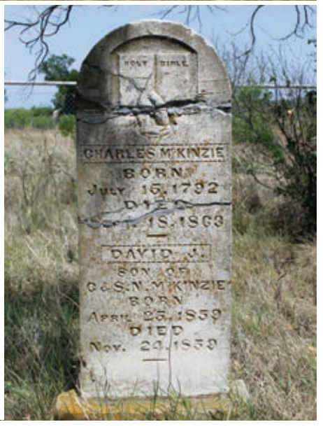
TOP: Sitting in the back of a pasture, off the beaten path, the tiny family cemetery of McKinzie gets few visitors.

ABOVE LEFT: This stone sitting in the middle of the cemetery stands as a testament to one of the eight original McKinzie families to settle this area.