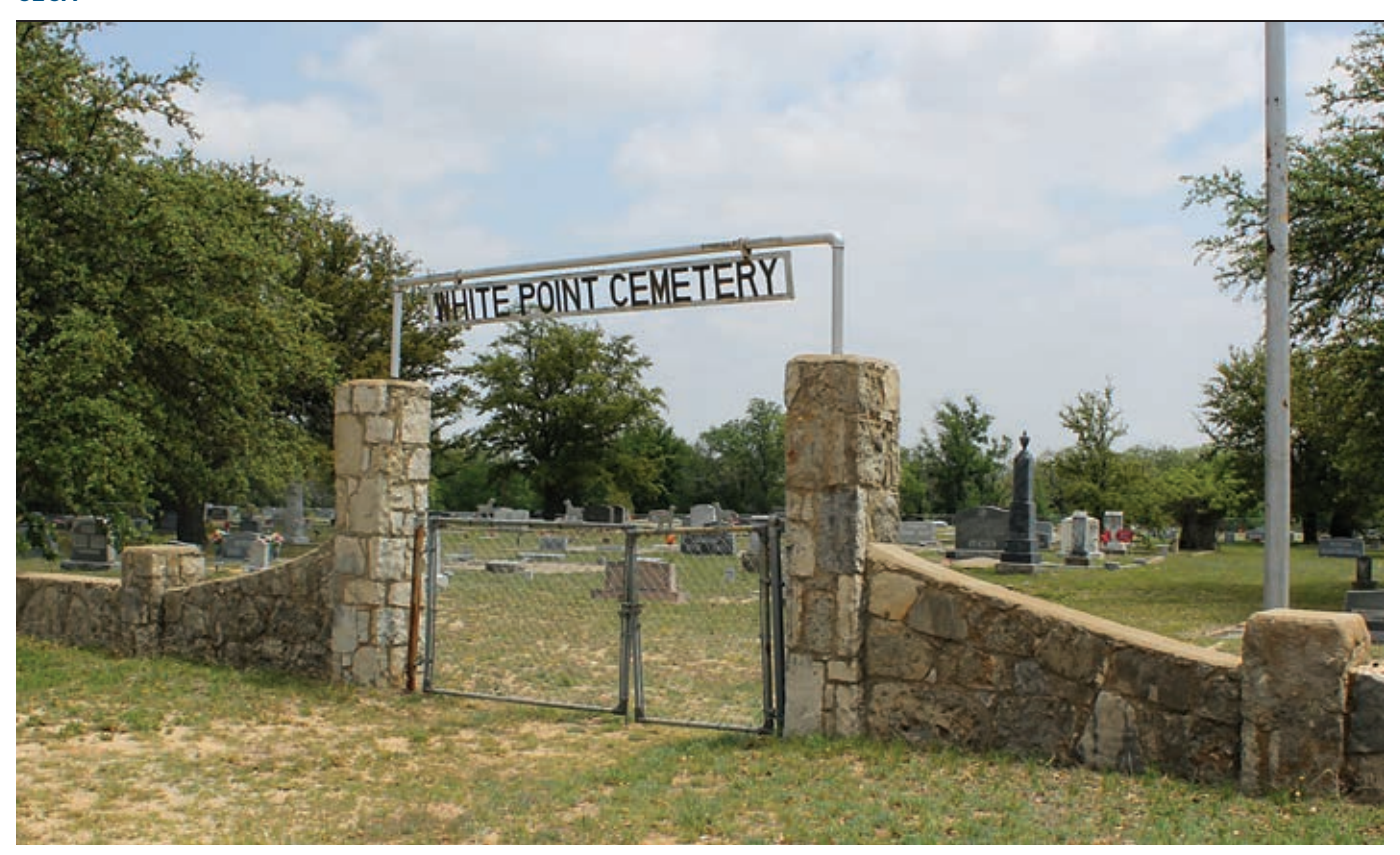
The largest of the four cemeteries, White Point is filled with memories of the lives of more than 400 people. The beautiful oak trees continue to shade and protect the old as well as the new tombstones.