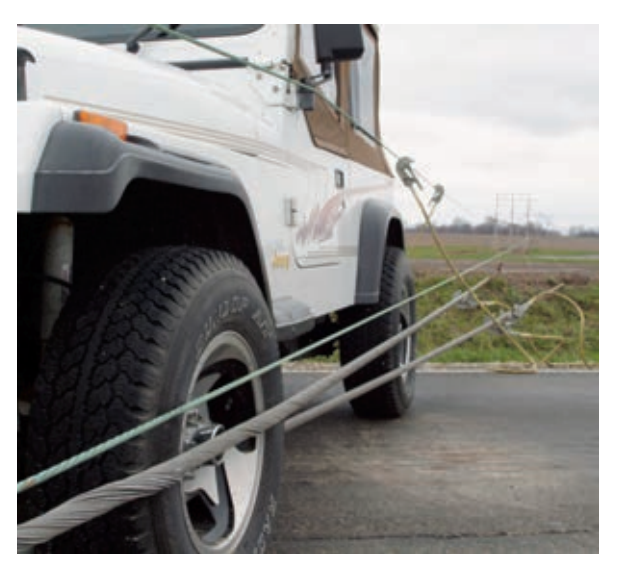
If your vehicle comes in contact with a power line, would you know what to do?

The electricity CECA provides day-in and day-out is a phenomenal resource, powering our modern lifestyles in a safe, reliable and affordable way. But electricity