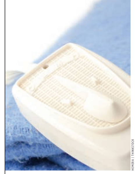
An electric blanket can keep you cozy, but you should never sleep on top of one or let the kids jump up and down on it.