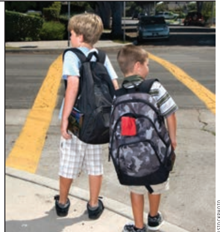
Encourage children to use crosswalks.