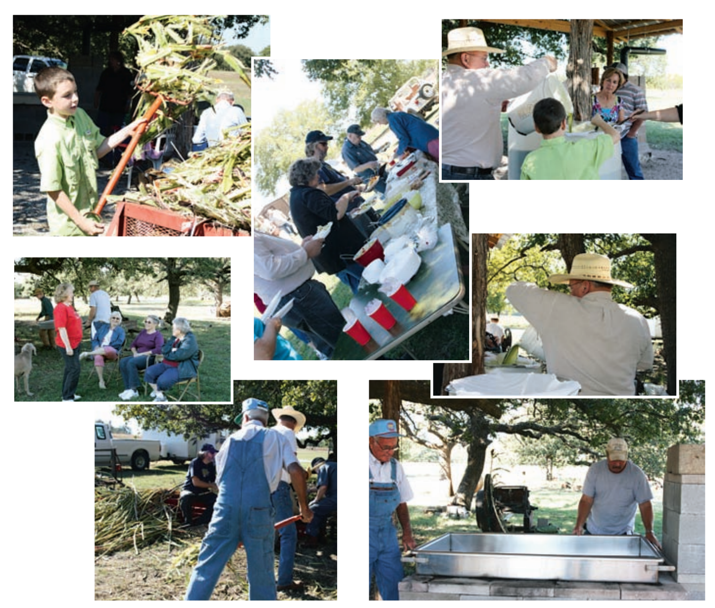
It takes everyone working (and resting) together to make the one-day syrup making a true success.

tried and ended up with the 'green glue.' That was all of the syrup making for a while."