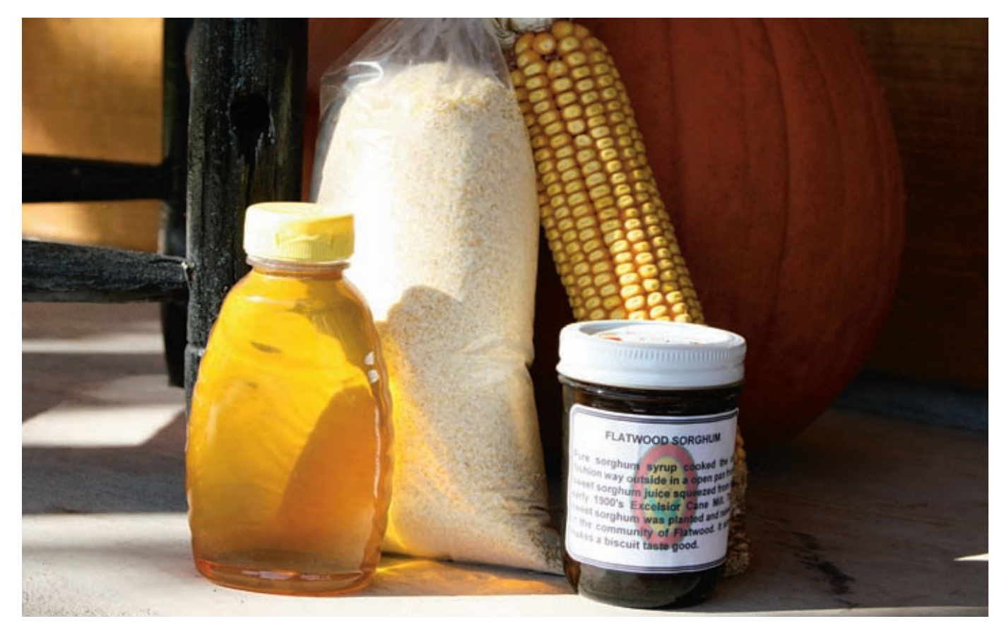
On Flatwood Farm, you can find fresh honey, home-cooked sorghum syrup and freshly ground cornmeal and flour. All are made of fresh ingredients grown on the family farm.