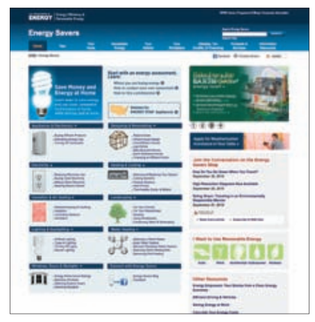
Use the online tools at www.energysavers .gov to do your own home energy audit.

Here are some tips for being green: I. ENERGY EFFICIENCY. Conduct an extensive energy audit of your home. There are a variety of online tools (www.energysavers.gov is a good place to start), or you can hire an energy specialist to do the audit for you. The audit should include checking your home for leaks—in air-conditioning ducts, windows, walls and the attic. If leaks are found, fix them before you