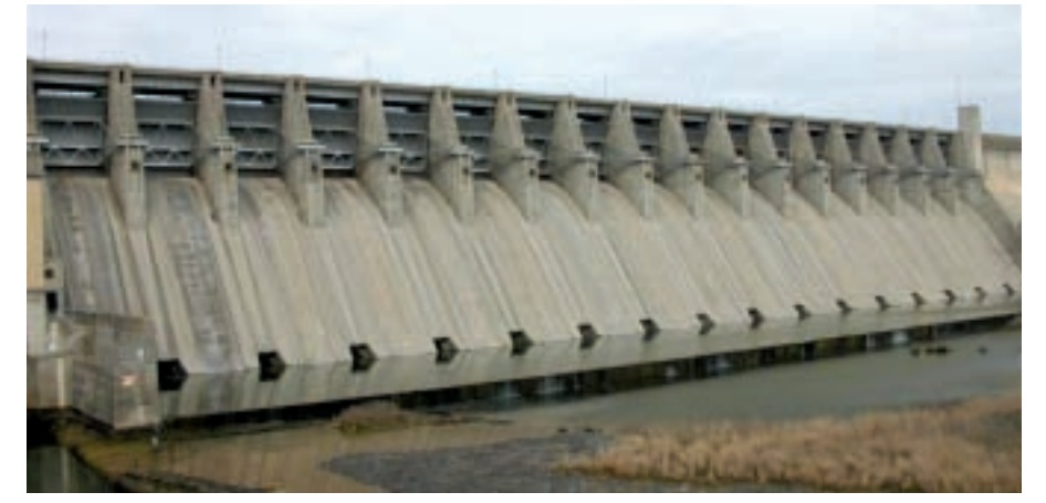
Lake Whitney Dam has two 15,000-kilowatt generating units.

So just how do we get electricity from water? Most conventional hydroelectric plants include four major components: a dam, a turbine, a generator and transmission lines. These plants capture the energy of falling