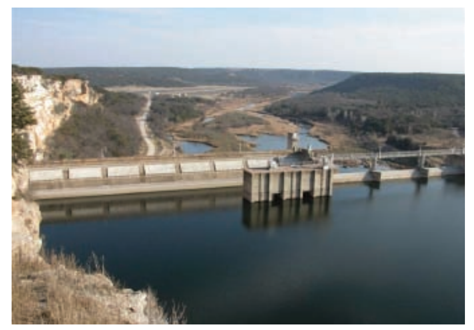
Possum Kingdom Dam is equipped with two 12,000 kilowatt hydroelectric generating units.

Hydroelectric generation began here in 1942, and the plant currently has two 12,000 kW hydroelectric turbinegenerating units.