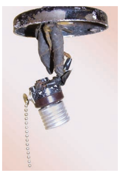
Look familiar? If your home is host to electrical wiring like this, it's time to call an electrician and make some improvements.

Because a third of American homes were built more than 50 years ago, home buyers and folks living in older homes should be aware of how wiring changed during the