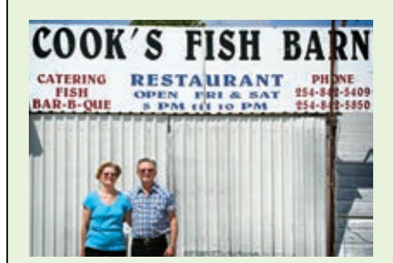
'CECA understands the needs of our small business.'

the IT professionals at CECA. They support and maintain all computer and communication systems, both internally and in the field.