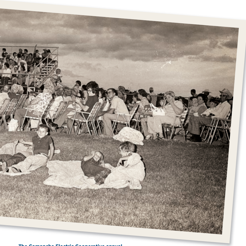
The Comanche Electric Cooperative annual meeting has always been a fun and relaxing experience for members of all ages.

Join us again next month as we bring you to current day with the past 25 years of the history of Comanche Electric Cooperative.