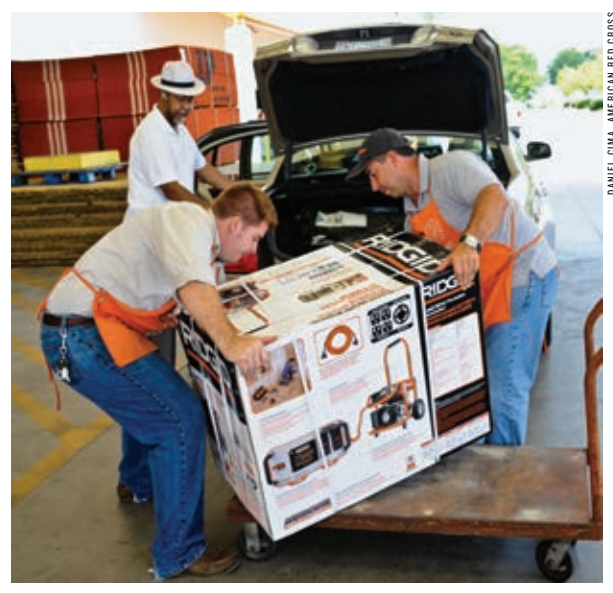
Portable generators are helpful in an extended power outage, but they can create serious safety hazards if not used correctly.

First rule of thumb? Never, ever use a generator indoors—even with windows open—or in an enclosed area, including an attached garage. Locate the generator where fumes cannot filter into your home through windows or doors—even 15