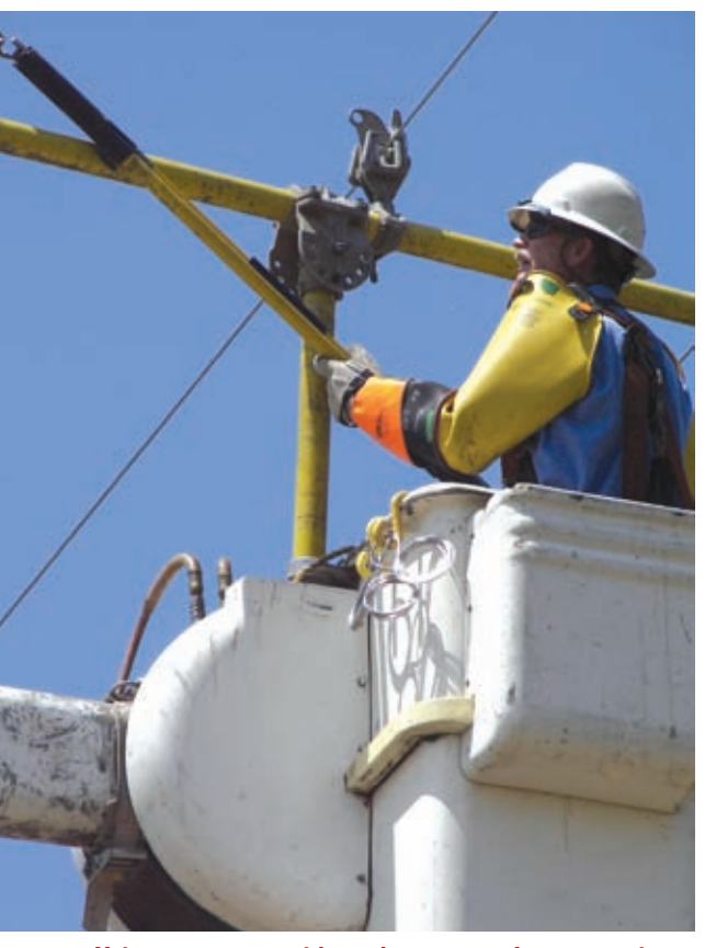
Using a generator without the proper safety precautions can cause injury-or even death-to co-op linemen working to repair an outage.

We encourage you to protect the well-being and safety of your family during outages and safeguard those who come to your aid during emergency situations. When we work together for safety and the good of our communities, we all benefit.