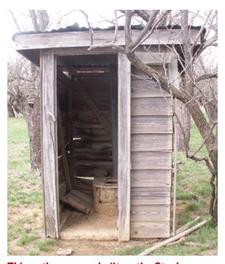
This outhouse was built on the Stephens County property in the early 1930s by the WPA.

tricity in the barn. She did most of the milking and would have to quit work early enough to have some light to milk by. With the installation of electric lights in the barn, she would work till dark and then go to the barn and milk the cows by the light of the incandescent bulbs, thus making her workday longer.