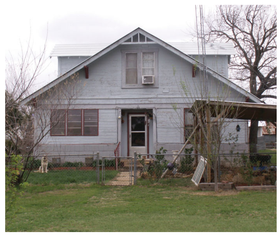
The original house in Stephens County is still in use.