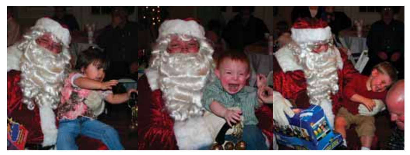
Not everyone likes Santa.