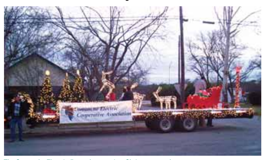
The Comanche Electric float takes part in a Christmas parade.