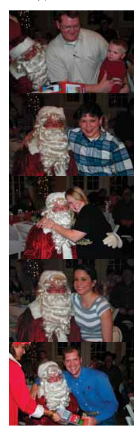
Even the big kids get into the act.

The employees of Comanche Electric Cooperative definitely caught the Christmas spirit in December. From Christmas parades to parties, here is our Christmas season in pictures. Enjoy!!