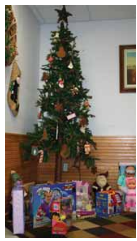
Just a few of the employee donations to Santa's Helpers.